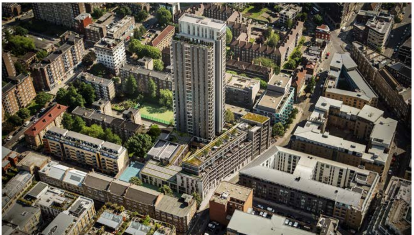
The Makers, Shoreditch