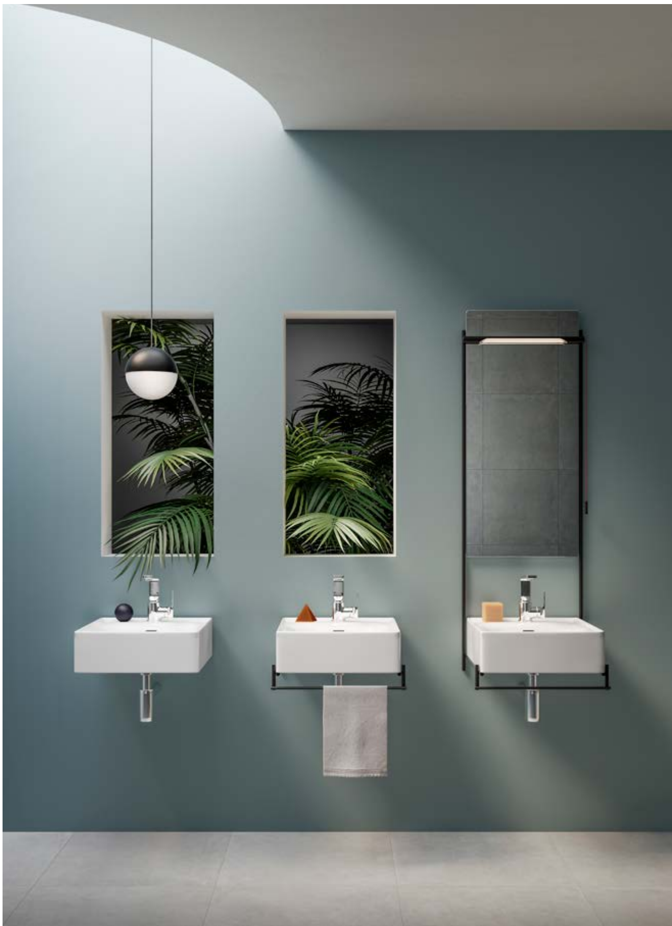
Washbasins from the Equal range, designed by Claudio Bellini for Vitra