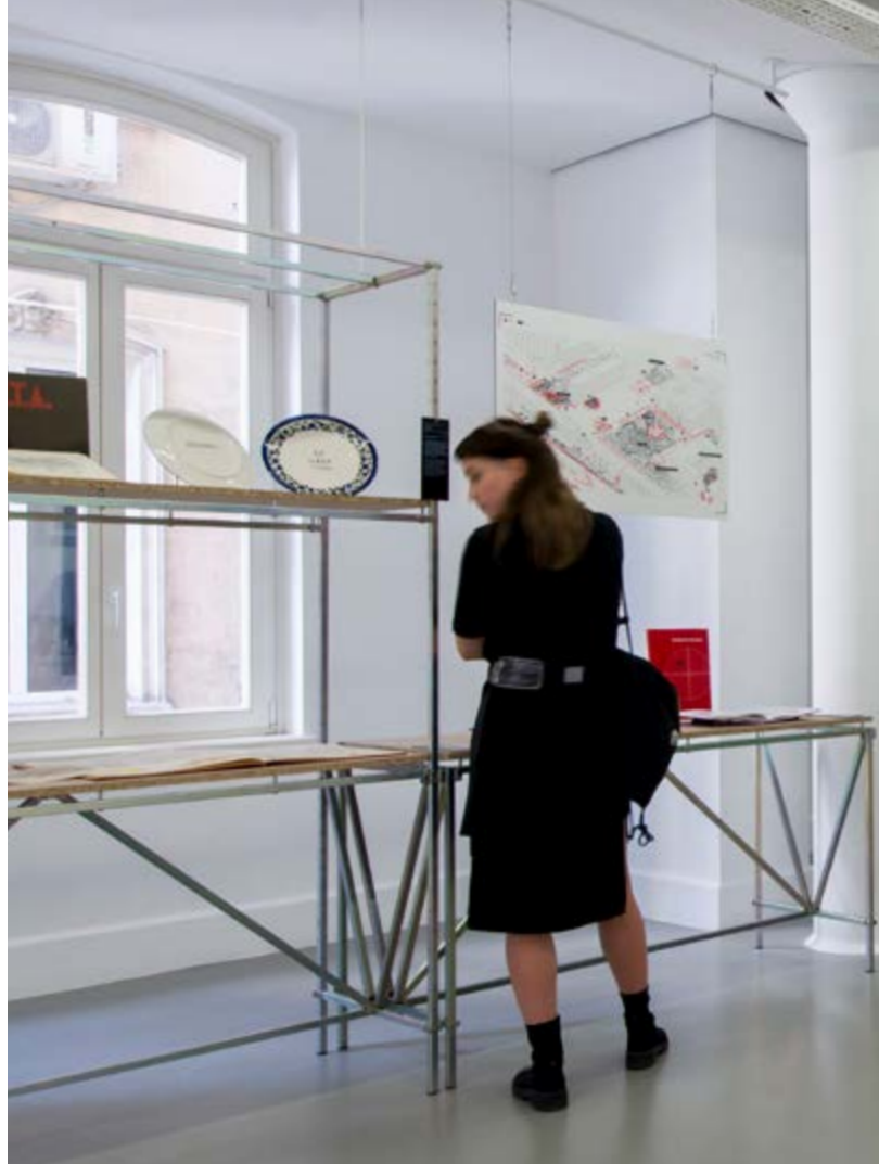
Fourth Istanbul Design Biennial, A School of Schools, 2018