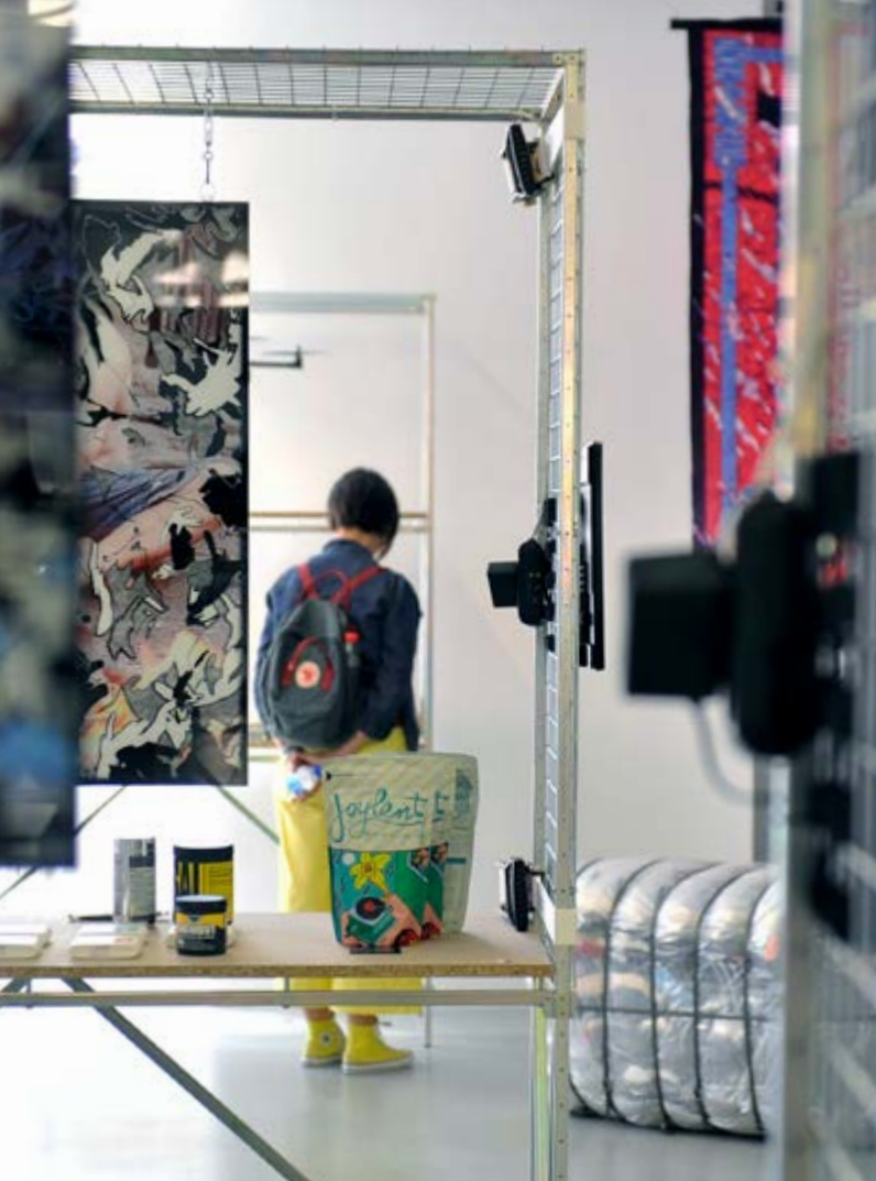
Fourth Istanbul Design Biennial, A School of Schools, 2018