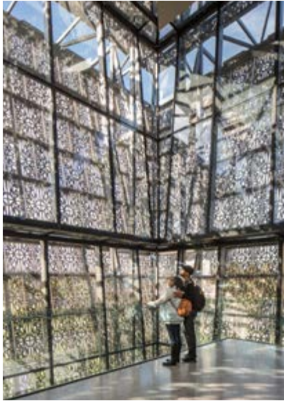
Smithsonian National Museum of African American History and Culture