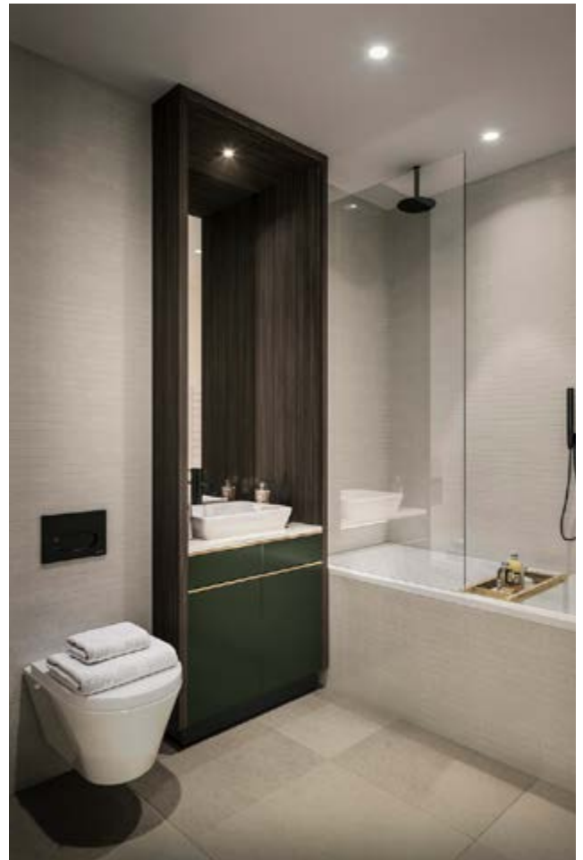
The Makers, Shoreditch, master bathroom, designed by Woods Bagot

The drive for innovation is a constant at Vitra, and the company continues to seek out opportunities through its research and development activities and through designer collaborations and industry partnerships – both here in the UK and globally.