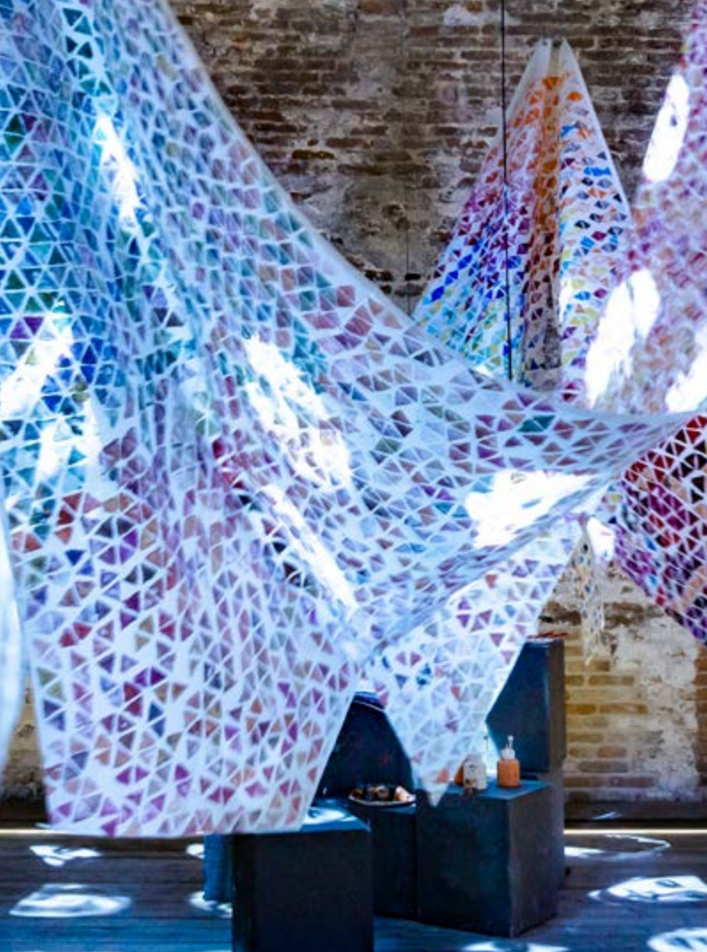
Sixteenth Venice International Architecture Biennale, Turkish Pavilion, The Shift