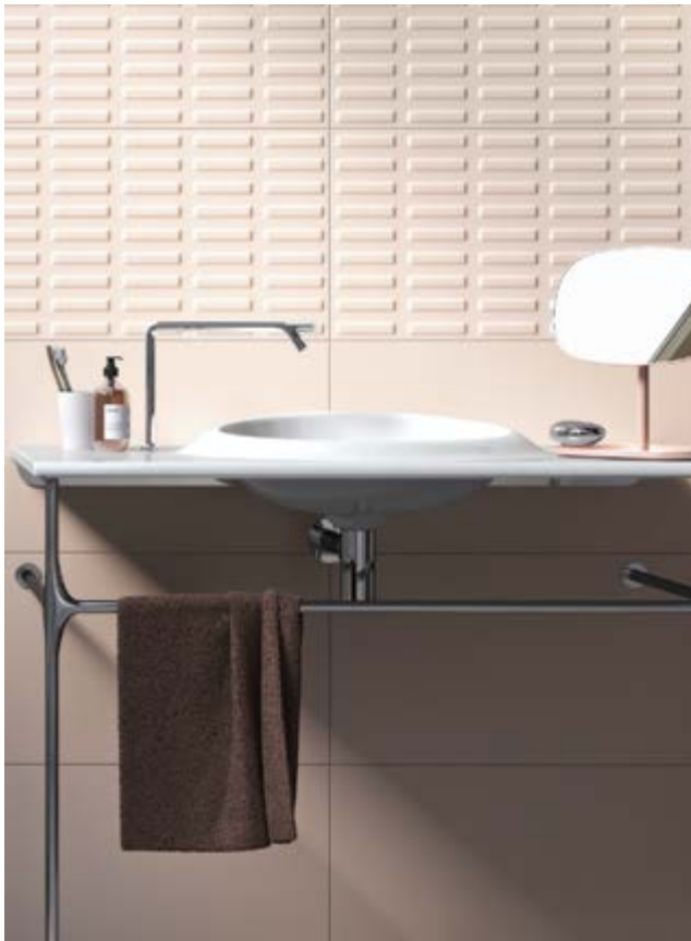
The Istanbul vanity basin, designed by Ross Lovegrove for Vitra

The decision to work with independent designers was made at Vitra in the late 1990s when the company was looking to expand its design horizons as the brand grew internationally. The first major collaboration was with Ross Lovegrove, whose debut Vitra collection Istanbul launched in 2004. The fluid forms of Istanbul proved revolutionary not only in terms of bathroom aesthetics but also in terms of production, with the single cast basin and pedestal requiring exceptional engineering skill. It may have presented a production challenge at the time but the iconic styling of the award-winning range means it's as relevant now as it was 15 years ago. The Vitra-Lovegrove partnership has since continued, with an open-frame Istanbul basin launched at Salone del Mobile in 2018.