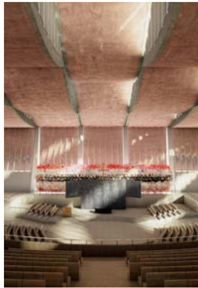
National Cathedral of Ghana