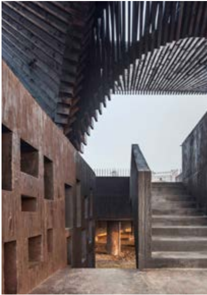
Gwangju River Reading Room