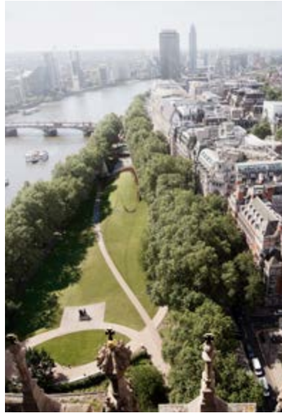
UK National Holocaust Memorial and Learning Centre