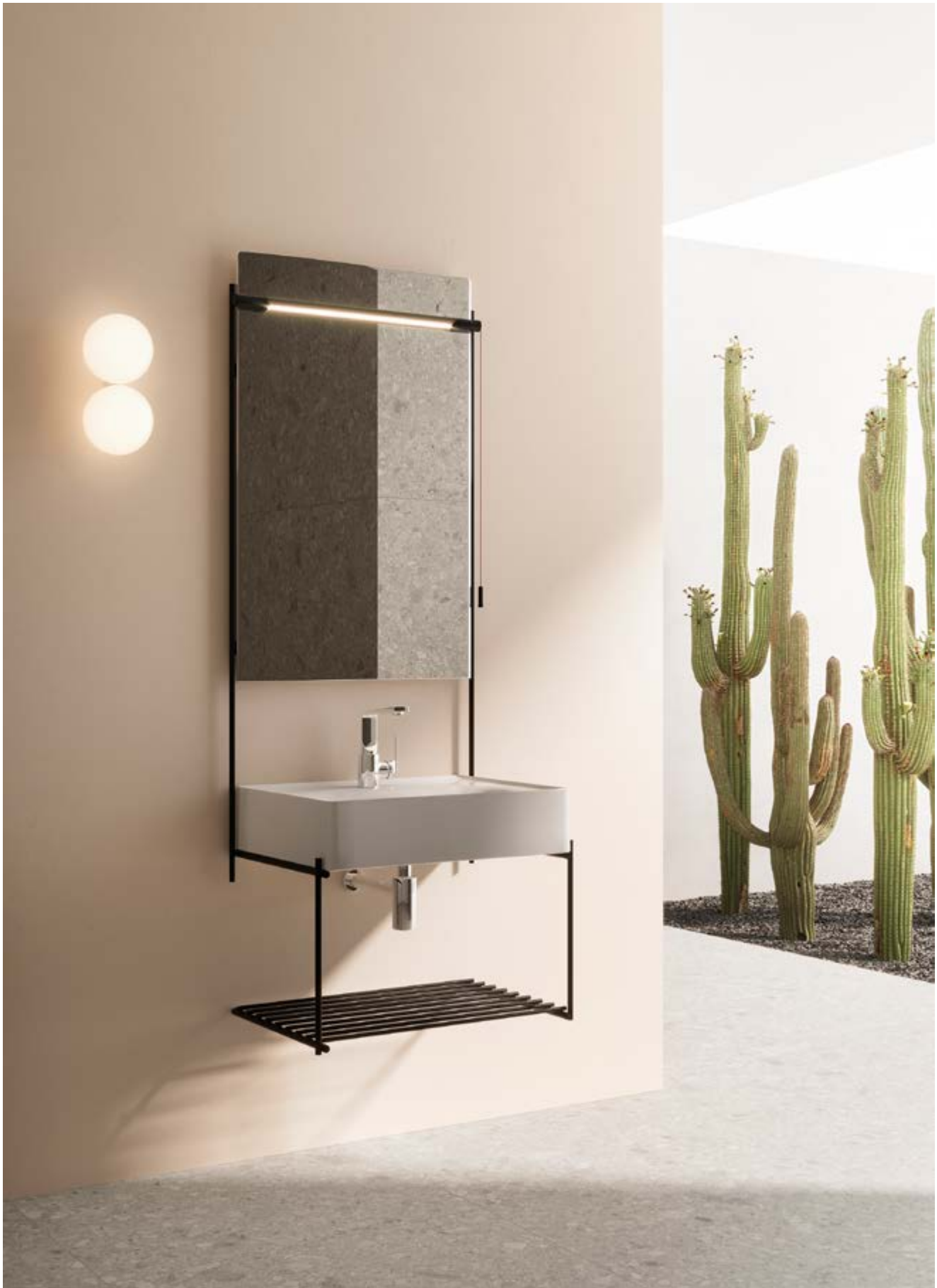
Wall-hung washbasin unit and mirror from the Equal range, designed by Claudio Bellini for Vitra