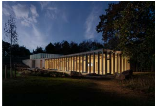
The Weston, Yorkshire Sculpture Park, designed by Feilden Fowles