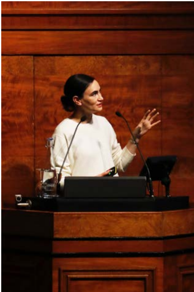
RIBA + Vitra Talks, Frida Escobedo

range of senses for the greater social good – with communities for instance, but also with planners and developers.