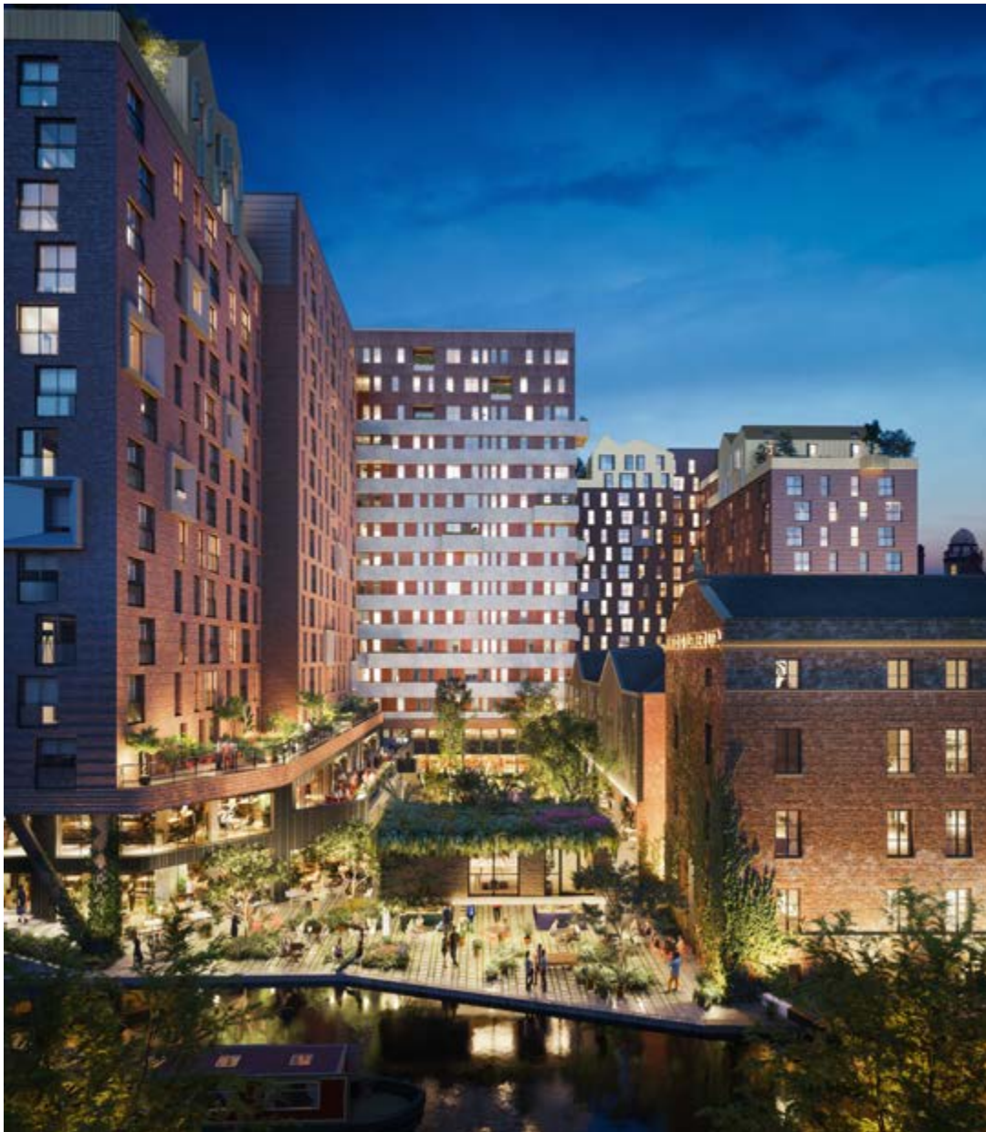
Kampus, Manchester, designed by ShedKM and Chapman Taylor

In relation to technological change in the wider construction sector Vitra has been quick to recognise the needs of the new generation of off-site fabricators springing up in response to increasing modularisation and prefabrication in construction. Recognising that dimensional accuracy is vital and that supply is key, Vitra is able to offer fast delivery of a large selection of products in a range of dimensions. There's no doubt that Vitra's order books reflect a snapshot of current design and construction activity in the UK.