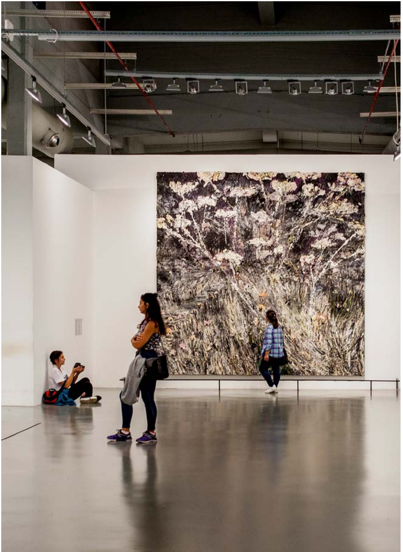
Istanbul Modern, 'Artists in Their Time' Virtual Tour, August 2017 – March 2018