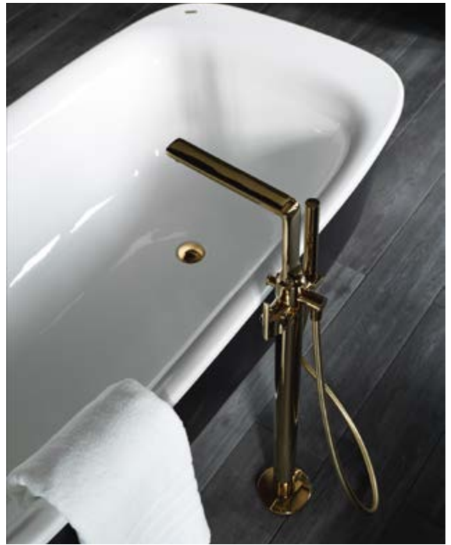
The Water Jewels bathtub with gold fixtures, designed by Matteo Thun for Vitra

Design collaborations are developed at Vitra's purpose built Innovation Centre, which incorporates a Smart Connected Technologies Lab where products such as smart mirrors and panels, child locks and intelligent-WC pans are developed. Vitra believes that these are just the starting point for electronics in bathrooms and that future possibilities are profound, particularly in terms of sustainability and accessibility. Vitra's Rimless WC technology, for example, has proved surprisingly important in environmental terms because it massively reduces the amount of chemicals needed for cleaning. Another example is intelligent flushing systems, which encourage people to understand how much water is being used and how they can control their consumption.