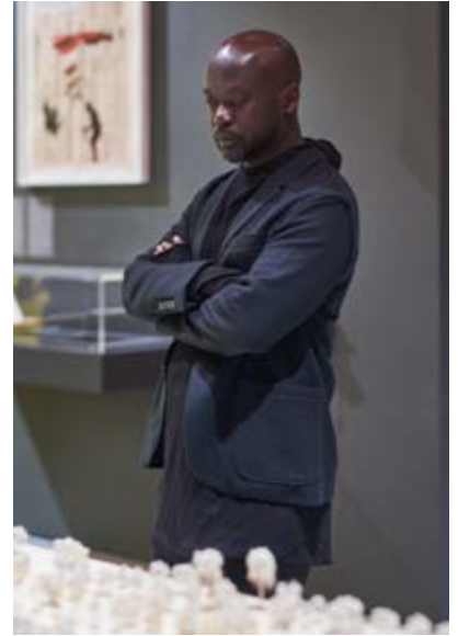
Sir David Adjaye

black history. But the building exterior also expresses cultural values in its symbolic form, referencing in its profile the historic crown motif celebrated in West African Yoruba sculpture – as illustrated by the historic carvings on display. In a similar way the design for the National Cathedral of Ghana is conceived as a ceremonial landmark in the city landscape, representing the collective cultural memories and hopes of a relatively new nation (in 1957 Ghana became the first African country to achieve independence from colonial rule). The building's dipping roof silhouette, as the exhibition demonstrates, alludes both to the tabernacle, one of the earliest structures of western religion, and the symbol of the Golden Stool, the divine throne of the Asante people. There are also references to traditional Ghanaian ceremonial umbrellas and Baoman canopies. Meanwhile in the UK the Mass Extinction Memorial Observatory (MEMO), will commemorate extinct species and loss of biodiversity in a building that takes its form and spatial organisation from the inspiration of a spiralling fossil embedded in the limestone landscape of the Isle of Portland.